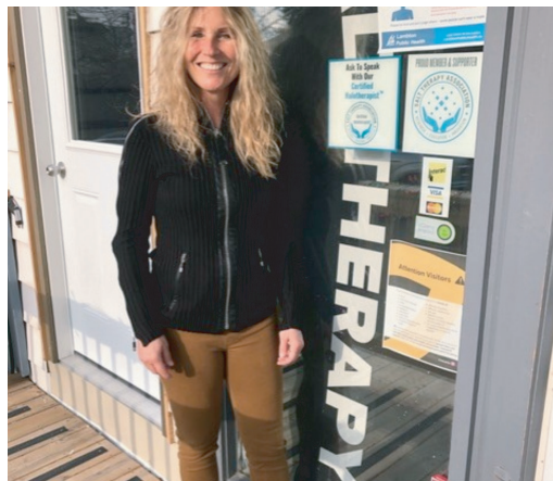
Purity Salt Cave and Wellness Spa Grand Bend, Ontario, Canada