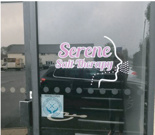
Serene Salt Therapy Omagh, United Kingdom