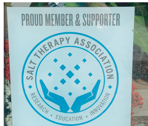
Fusions Spa & Wellness Sylva, North Carolina

Please visit the STA Booth to sign up as a Facility Member and receive your Window Decal.