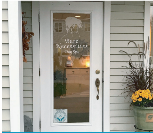
Bare Necessities Day Spa Londonderry, New Hampshire