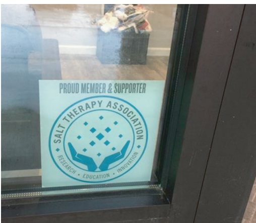
The Salt Retreat Frisco, Texas