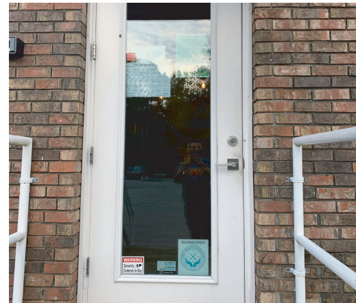
Above and Beyond: Yoga and Salt Therapy Mobile, Alabama