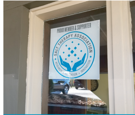
Linscott Salt and Wellness Marysville, Ohio