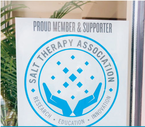
Intown Salt Spa Atlanta, Georgia

SALT THERAPY ASSOCIATION 2022 CONFERENCE LIVE